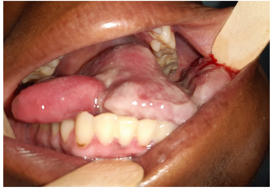
Figure 1. Giant ossifying fibroma of the mandible: massive size, involvement of the mandible, floor of the mouth, cheek, covering the tongue.

Ossifying fibroma, a benign bone tumour often considered to be type of fibroosseous lesion, can affect both the mandible and maxilla, but is more frequently seen in the mandible with an incidence of 70-90% of the cases. [1] Clinically this tumour appears as a slowly growing intrabony mass which is often asymptomatic and rarely large enough to cause facial deformity or functional problems. [2] It is commonly seen in the third and fourth decades of life. Radiographically, the lesion is often unilocular and well defined with varying degrees of mineralization. This bone tumour consists of highly cellular, fibrous tissue that contains varying amounts of calcified tissue resembling bone, cementum or both. [3] Treatment consists of enucleation and curettage or surgical resection for larger lesions. The