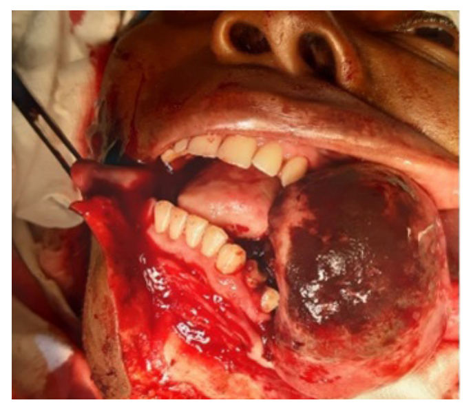
Figure 3. Exposure of tumour through Modified Risdon approach, opening midline.